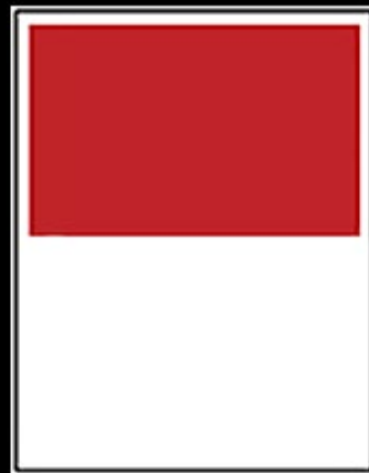
Half Page Horizontal $600