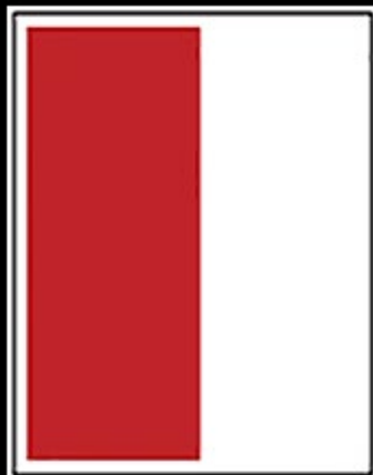
Half Page Vertical $600