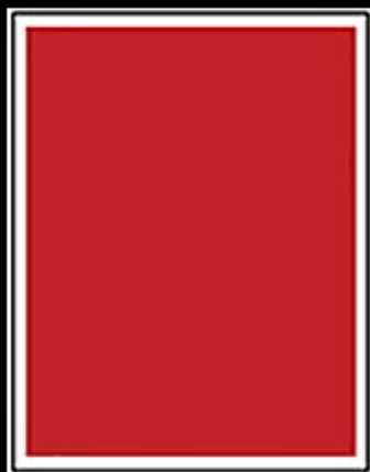
Full Page $1000