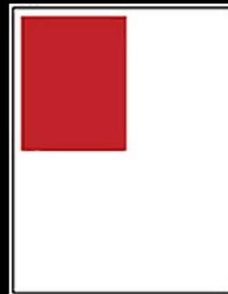
Quarter Page $350

Files Accepted: 300dpi/resolution / RGB Formats: .jpg, .png, or .psd.